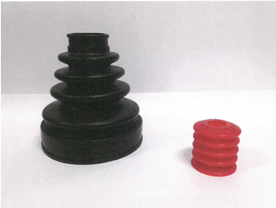
Rubber Bellows made in different shapes and sizes