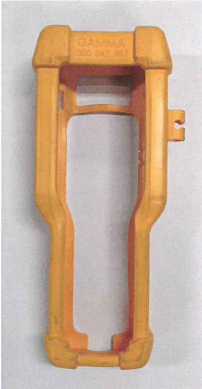
Protective covers for hand held scanners